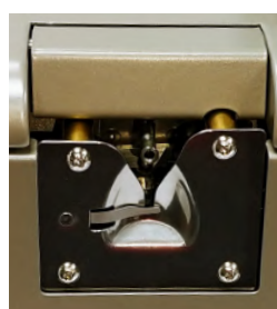
Automatic threading paired with unique Yarn Monitor Switch (YMS)