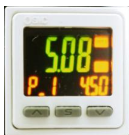
Air pressure digital meter to prevent the malfunctioning of the machine during operation