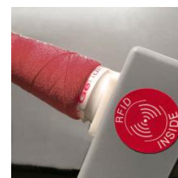
YRS® - Our proprietary system to protect the customer quality standard through RFID technology